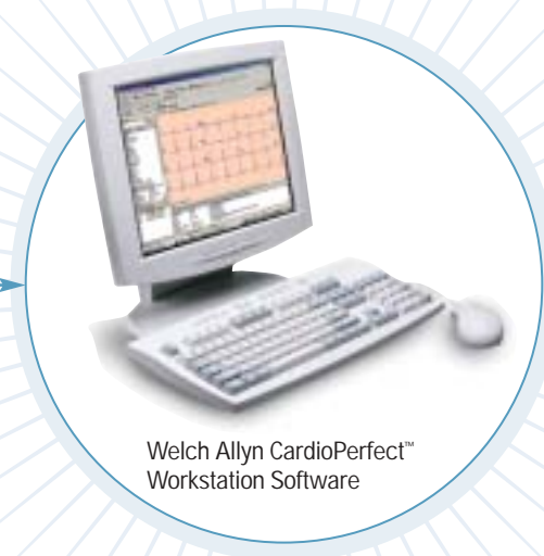
Welch Allyn CardioPerfect™ Workstation Software