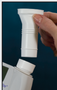
2. Insert single-use AstraGuard filter into FloTube.