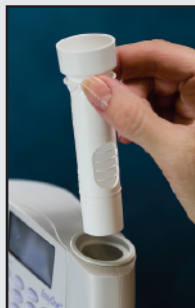
1. Attach FloTube to ndd spirometer.