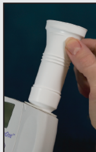
3. Spirometer is ready to use.