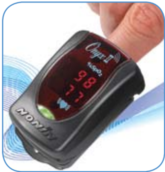
Onyx® II, Model 9560 - The World's First Bluetooth® Wireless Fingertip Pulse Oximeter

The Onyx II, Model 9560 with Bluetooth wireless technology is designed with our proven PureSAT® oximetry technology and delivers the trusted, precision accuracy of the entire Onyx line. And now with the advantage of wireless monitoring capabilities — the built to last and easy-to-use Onyx II 9560 provides unparalleled versatility for patient and clinician. Plus, with the addition of innovative new features such as Extended Range and Power Saver — it's ideal for home patient use.