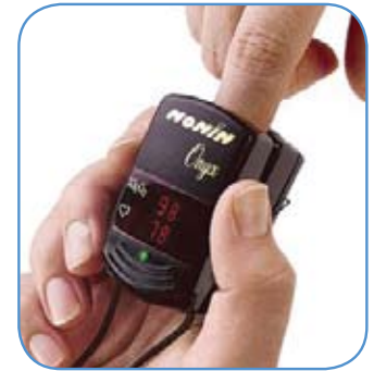
Onyx®, The World's First Fingertip Pulse Oximeter

The Nonin Onyx is the most widely used and trusted fingertip pulse oximeter by clinicians and patients worldwide. The Onyx is a proven performer with the widest range of patients from pediatric to adult, light to dark skin tones and good to low perfusion. The accuracy of Onyx fingertip oximeters is a result of Nonin Medical's superior PureSAT® signal processing technology that removes noise, artifact and/or interference that may affect readings — providing consistently accurate oximetry readings you can depend on.